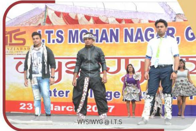
WYSIWYG @ I.T.S