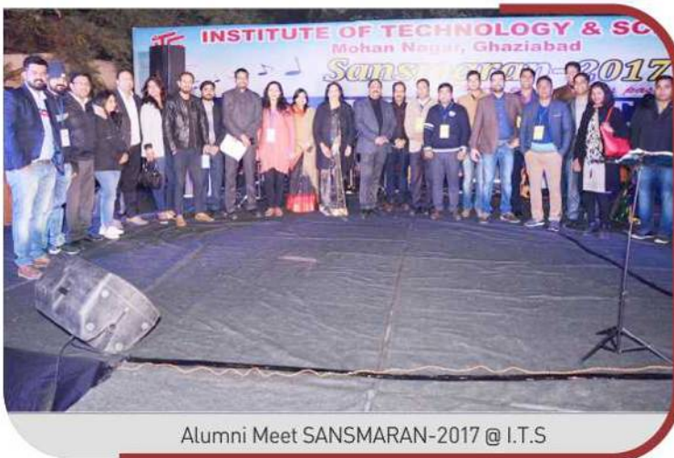
Alumni Meet SANSMARAN-2017 @ I.T.S