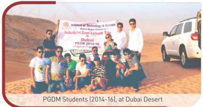
PGDM Students (2014-16), at Dubai Desert