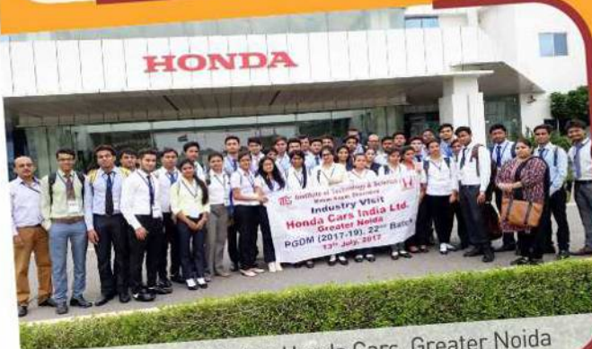
Industrial Visit to Honda Cars, Greater Noida