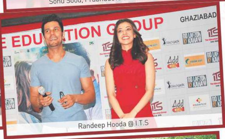
Randeep Hooda @ I.T.S