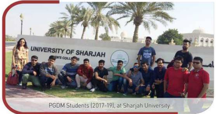
PGDM Students (2017-19), at Sharjah University