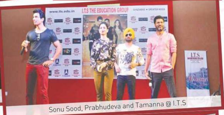
Sonu Sood, Prabhudeva and Tamanna @ I.T.S