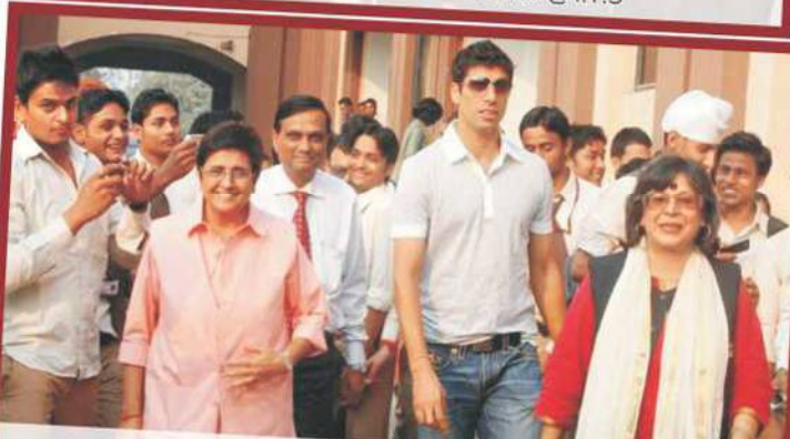
Ashish Nehra, Kiran Bedi @ I.T.S