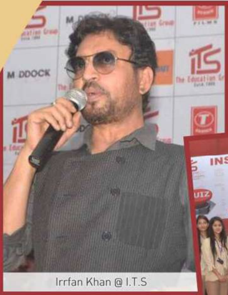
Irrfan Khan @ I.T.S