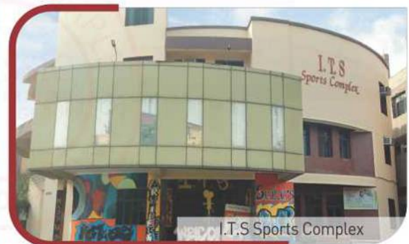
I.T.S Sports Complex