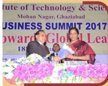
Ms. Nirmala Sitharaman @ Business Summit 2017

I.T.S. believes in teaching learning processes that nurture innovation, with the objective of enhancing proficiency and productivity. Therefore, we provide various opportunities to the students in the form of Guest Lectures, International Conferences, CXO talks, I.T.S Utkrishi Marketing Awards-2016, Seminars and Workshops to bridge the gap between class room teaching and the corporate world. The Institute organizes these interactive sessions at regular intervals to provide valuable insights of contemporary industrial perspective and the current socio-economic environment. Some of the eminent speakers over the years include: