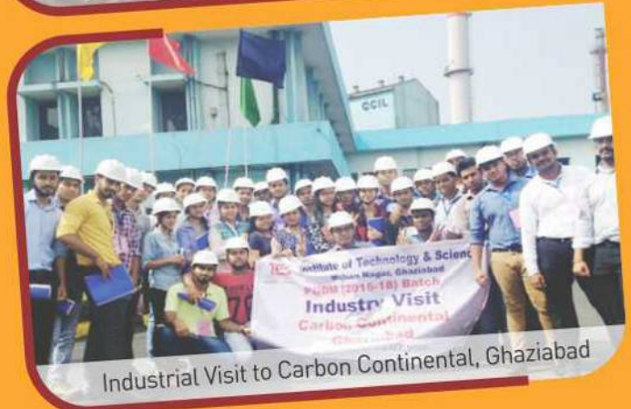
Industrial Visit to Carbon Continental, Ghaziabad