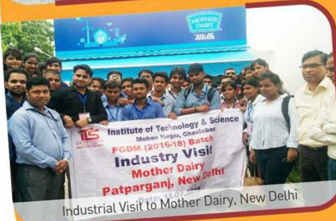
Industrial Visit to Mother Dairy, New Delhi