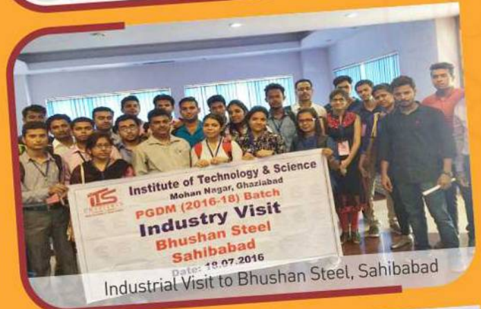
Industrial Visit to Bhushan Steel, Sahibabad