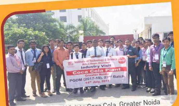
Industrial Visit to Coca Cola, Greater Noida