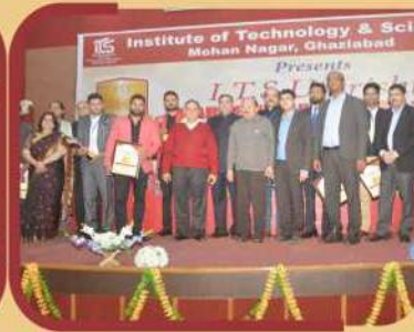
Prize winners @ I.T.S Utkrishi 2017