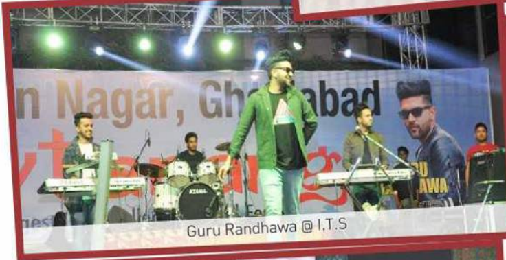
Guru Randhawa @ I.T.S