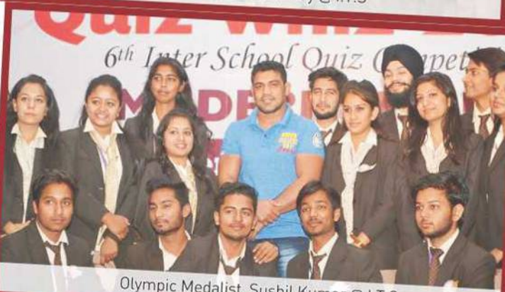
Olympic Medalist, Sushil Kumar @ I.T.S