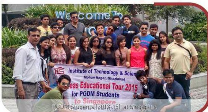
PGDM Students (2013-15), at Singapore