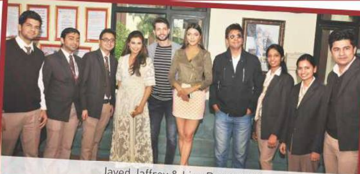
Javed Jaffrey & Lisa Ray @ I.T.S