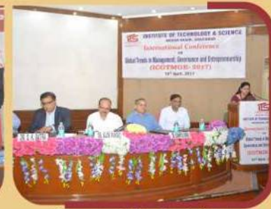
Renowned Academicians @ International Conference 2017