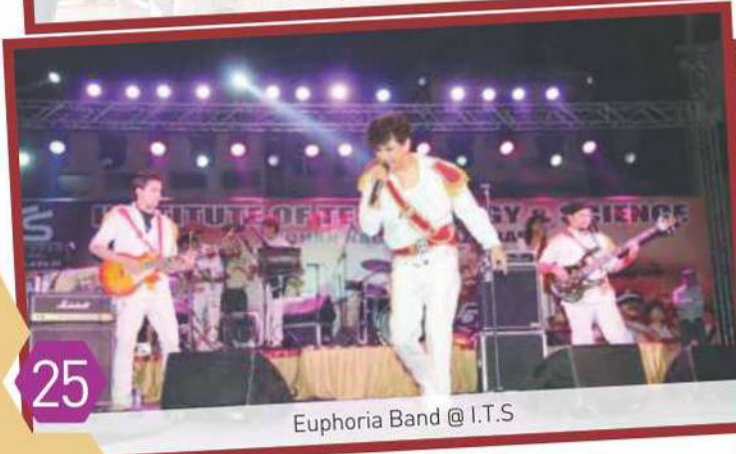
Euphoria Band @ I.T.S