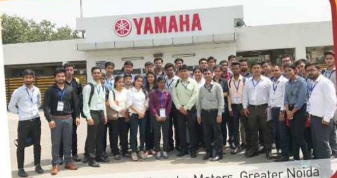
Industrial Visit to Yamaha Motors, Greater Noida