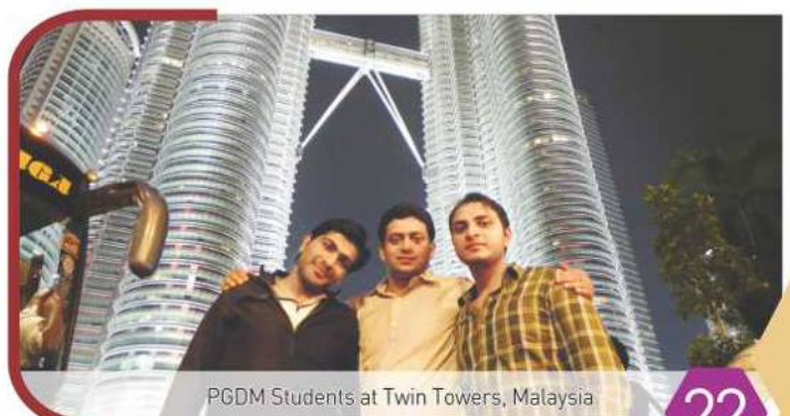
PGDM Students at Twin Towers, Malaysia