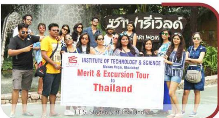
I.T.S. Students at Thailand