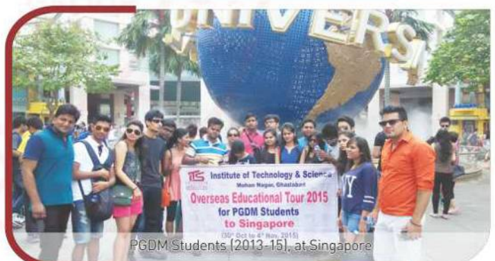
PGDM Students (2013-15), at Singapore