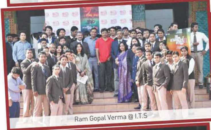
Ram Gopal Verma @ I.T.S