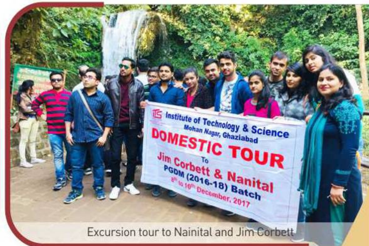
Excursion tour to Nainital and Jim Corbett