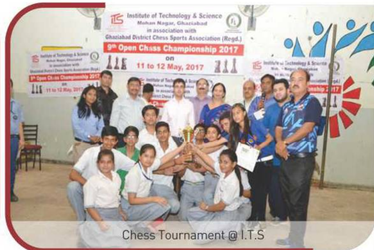
Chess Tournament @ I.T.S