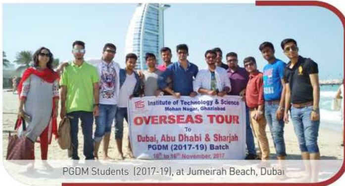
PGDM Students (2017-19), at Jumeirah Beach, Dubai

The world has turned into a global village with cultural diversity. Making career in such global landscape is no longer inspirational rather a way of corporate life. Acknowledging this fact, I.T.S takes students for a Foreign Tour to understand nuances of working in multicultural plural world. Tour aims at exposing students to organizations of repute with multicultural teams. Students are given opportunity to interact with such teams and get a feel of challenges of coordination and cohesion of such teams. During the tour students also visit renowned management educational institutions and have interaction with faculty and students to understand the educational and cultural environment of that country.