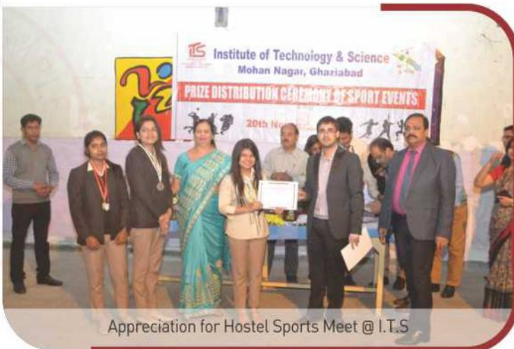
Appreciation for Hostel Sports Meet @ I.T.S