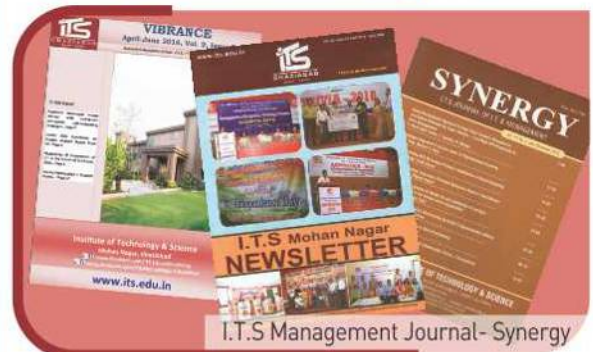
I.T.S Management Journal- Synergy