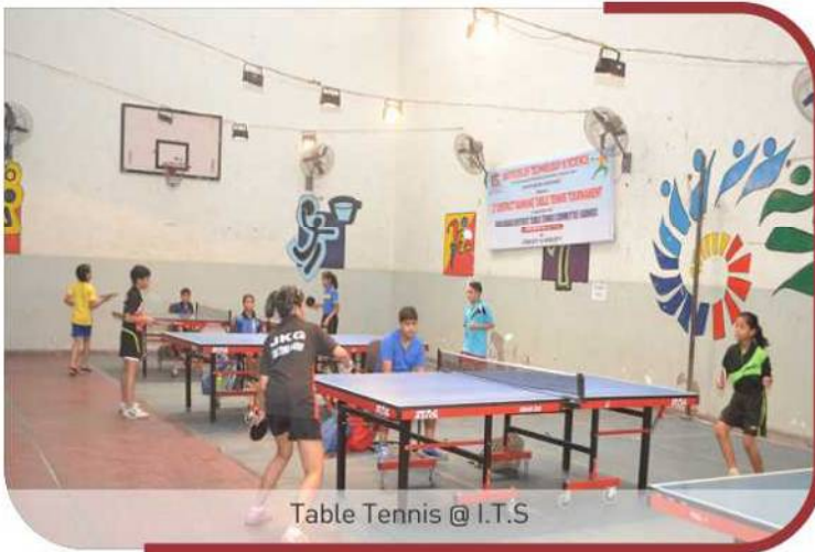
Table Tennis @ I.T.S