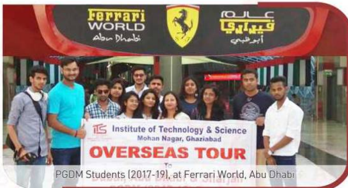
PGDM Students (2017-19), at Ferrari World, Abu Dhabi